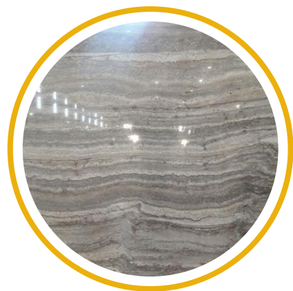
TRAVERTINE LIGHT SILVER