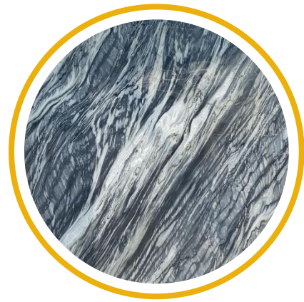
SILVER STREAM QUARTZITE