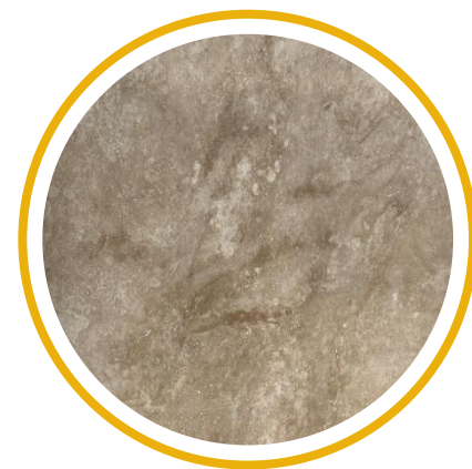
TRAVERTINE DARK NOOCHE