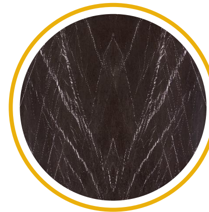
ARMANI GREY MARBLE