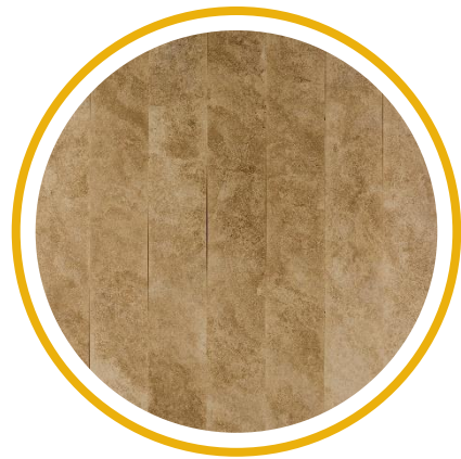
TRAVERTINE LIGHT NOOCHE