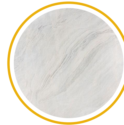
MONT BLANC QUARTZITE